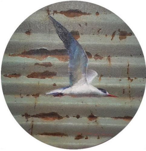
'Far From Home'