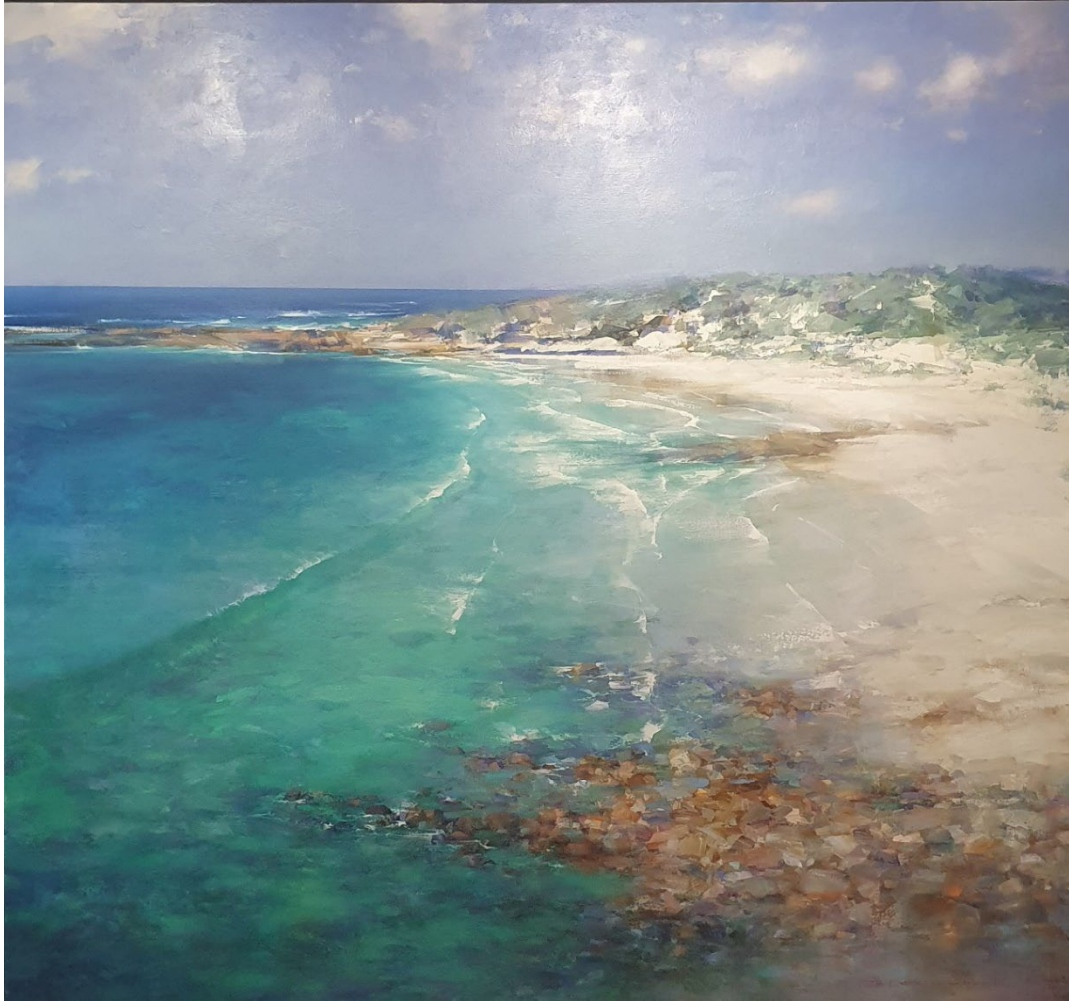
'Sweeping Swell, Daley head'