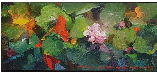
'Corner Of The Garden'