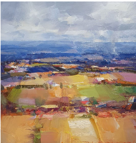
'Looking South, McLaren Vale'