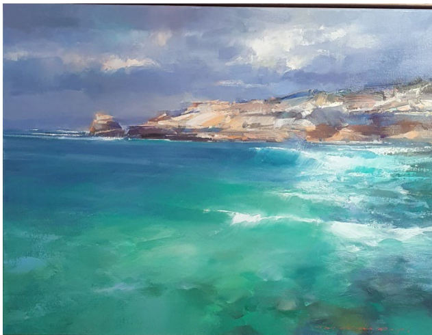
'Along The Reef, High Cliff'