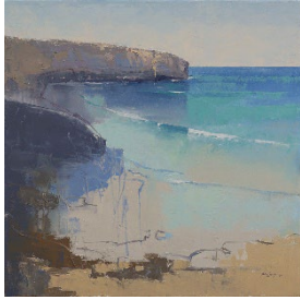
‘Tranquil Day, Pennington Bay’