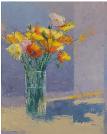
'As Colours Intertwine'