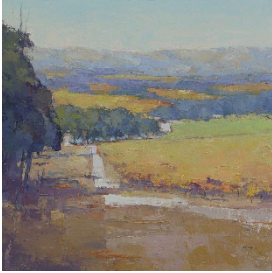
Lengthening Shadows, Blewitt Springs'