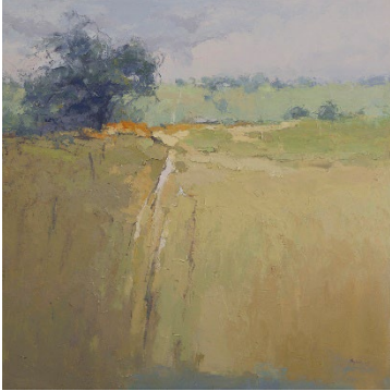
'As Showers Ease'