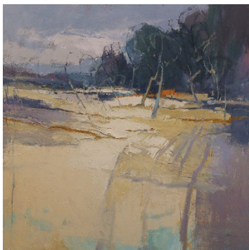
'Parched Recovery, K.I.'