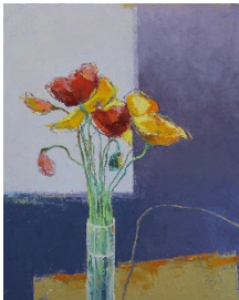
'They Make Me Smile'