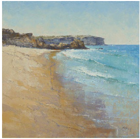
‘Looking Back, Pennington Bay’