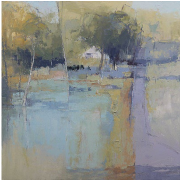
'Heading Towards The Dam'