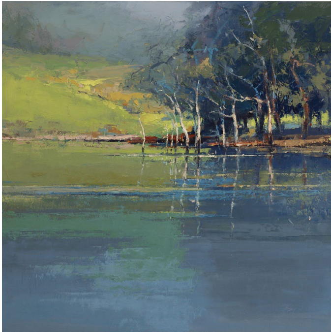
'Dam Blues, Yundi'