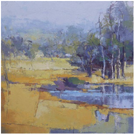
'As Shadows Cross The Dam'