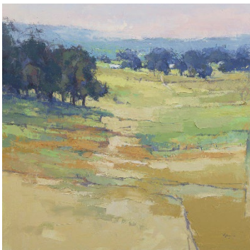
'Beyond The Tree Lot'